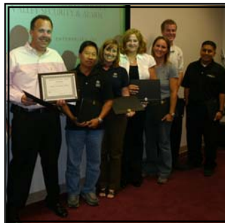
OUTSTANDING TEAM AWARD VALLEY SANITARY SUPPLY